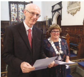
The Friends of Disley Station (FODS)